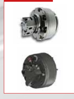
RADIAL PISTON MOTORS