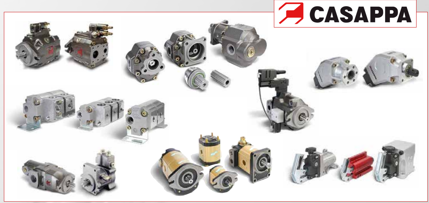
RADIAL PISTON MOTORS