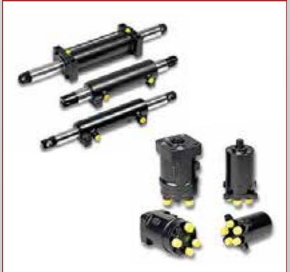
POWER STEERING UNITS