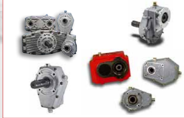
OVER-GEAR SPEED REDUCERS